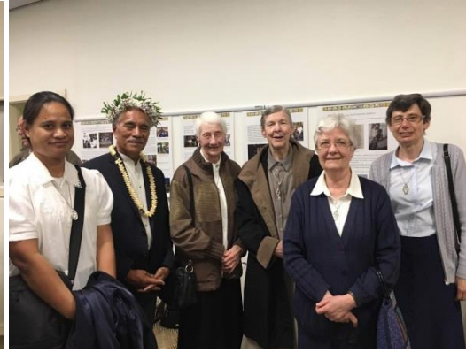
Daughters of Our Lady of the Sacred Heart with Anote Tong