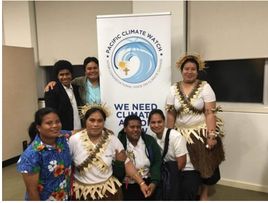
Pacific Islander religious sisters from various congregations