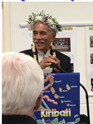
Chair of Inter-congregational Voice on Climate Change in the Pacific introducing the night