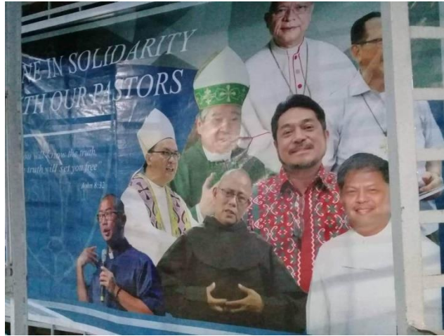
September 3 Launch of the 2019 Social Justice Statement, Mary McKillop Place, North Sydney